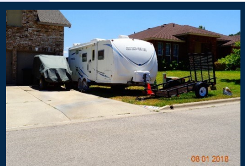
RV and trailers parked on lawn

A maximum of 50% of the required front and side yard may be improved to allow parking of vehicles, boats, recreational vehicles, campers, and trailers. Additionally, 25% of the rear yard may be improved for parking. You may call the City's Planning Department at (254) 953-5647 to find out more information about your specific property and contact the Bell County Health Department for approval if you have a septic system on your property.