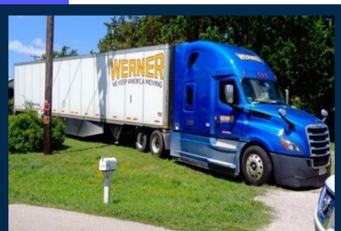
Heavy vehicle parked at residence

Gravel parking areas that were installed prior to the Ordinance adoption on September 6, 2020, will not be subject to the new restrictions. If the City is able to verify that your parking areas or driveway were installed prior the Ordinance taking effect, it will be considered legal non-conforming or "Grandfathered" by our Zoning Code. This includes gravel or dirt driveways that were installed prior to the new Ordinance adoption.